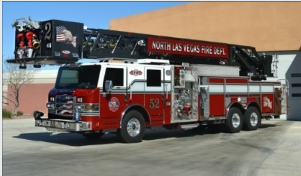
With 268 Funding