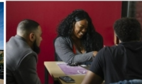
Small Business Connector's pandemic relief funding boosts businesses in valley