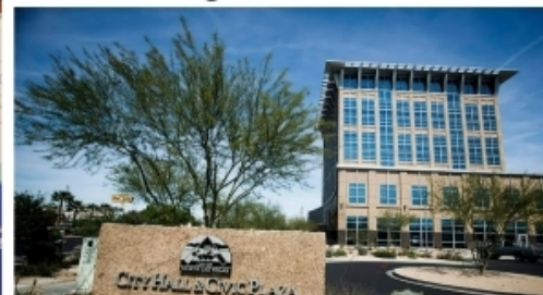
North Las Vegas small business hub booming