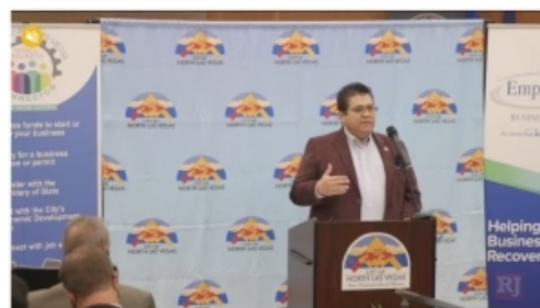
North Las Vegas unveils hub for small businesses