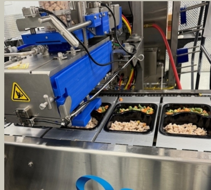
Above is CCSN's new automated tray line preparing meals for the MOW program.